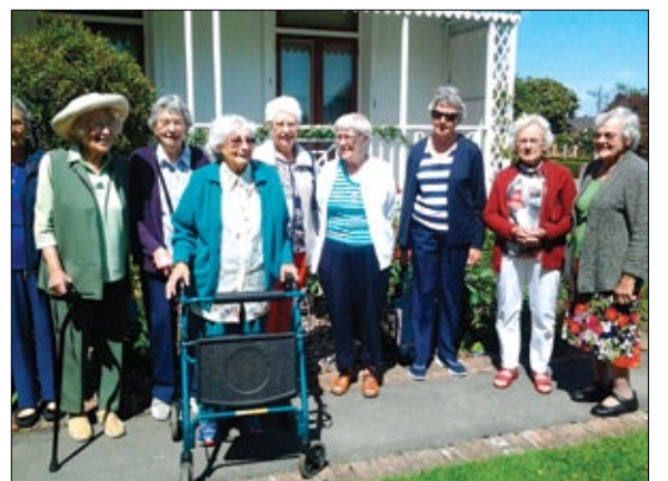
St Barnabas members

St Barnabas Stoke members went to Broadgreen House for their first meeting. They had morning tea in the meeting room and then wandered around the beautiful Rose Garden and noted some of their favourite roses. They then went back to the house for lunch.