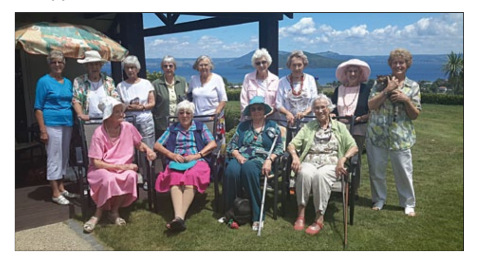
St Luke's Rotorua

On a calm, slightly cloudy morning twelve women from Holy Trinity, Tauranga arrived at the home of member Craig Capamagian, a beautiful location overlooking the harbour, for our annual garden party. We strolled around the spacious, cottage garden appreciating its